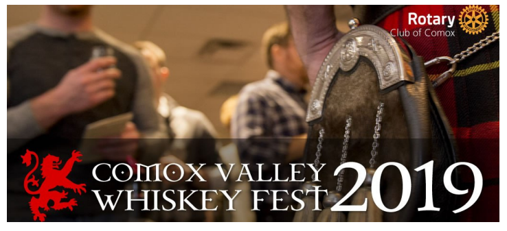
COMOX VALLEY WHISKEY FEST -February 2020 Net Proceeds $6435